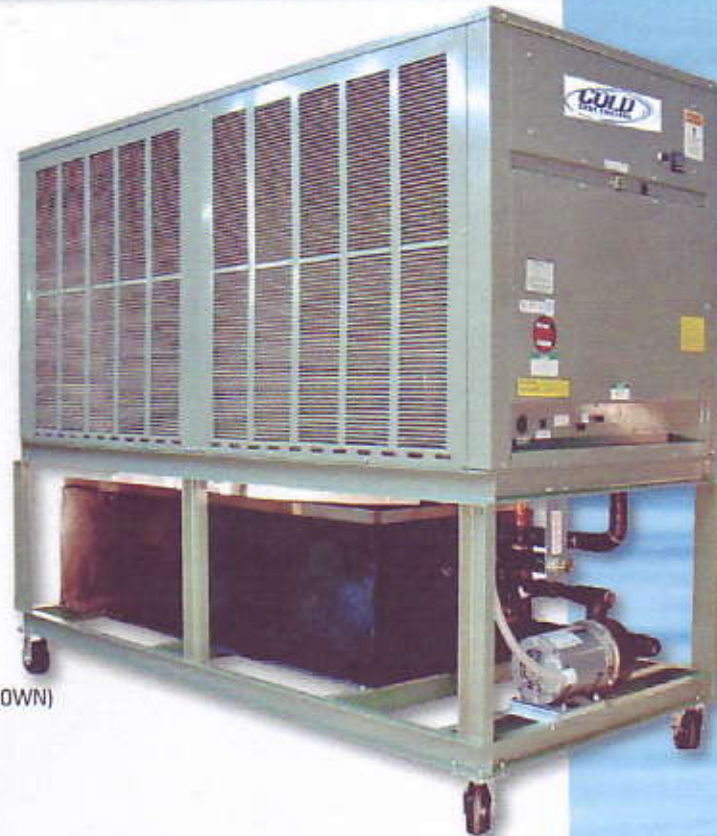
(15-TON UNIT SHOWN)